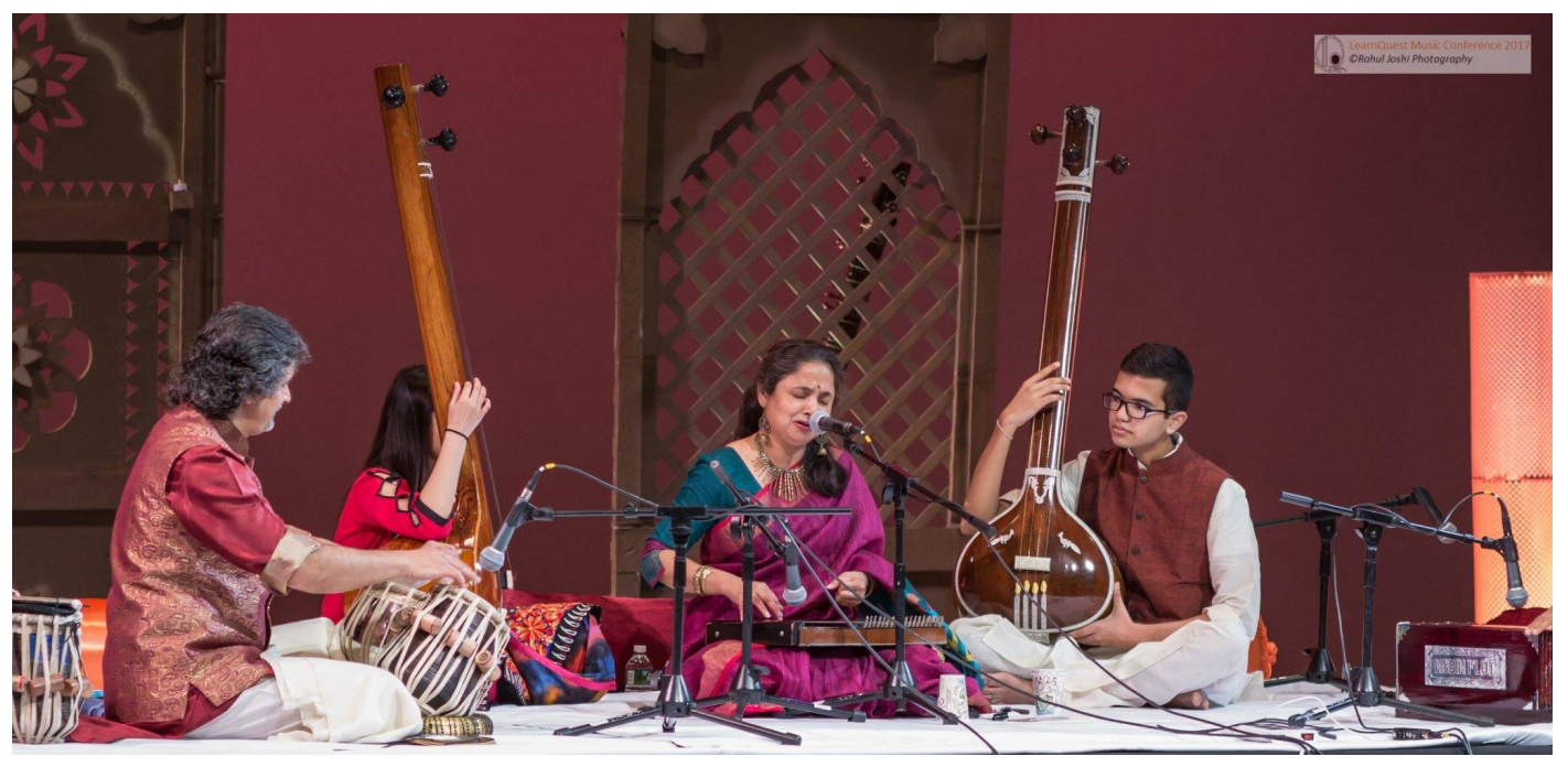
LearnQuest Music Academy Conference (Boston, USA, 2017)