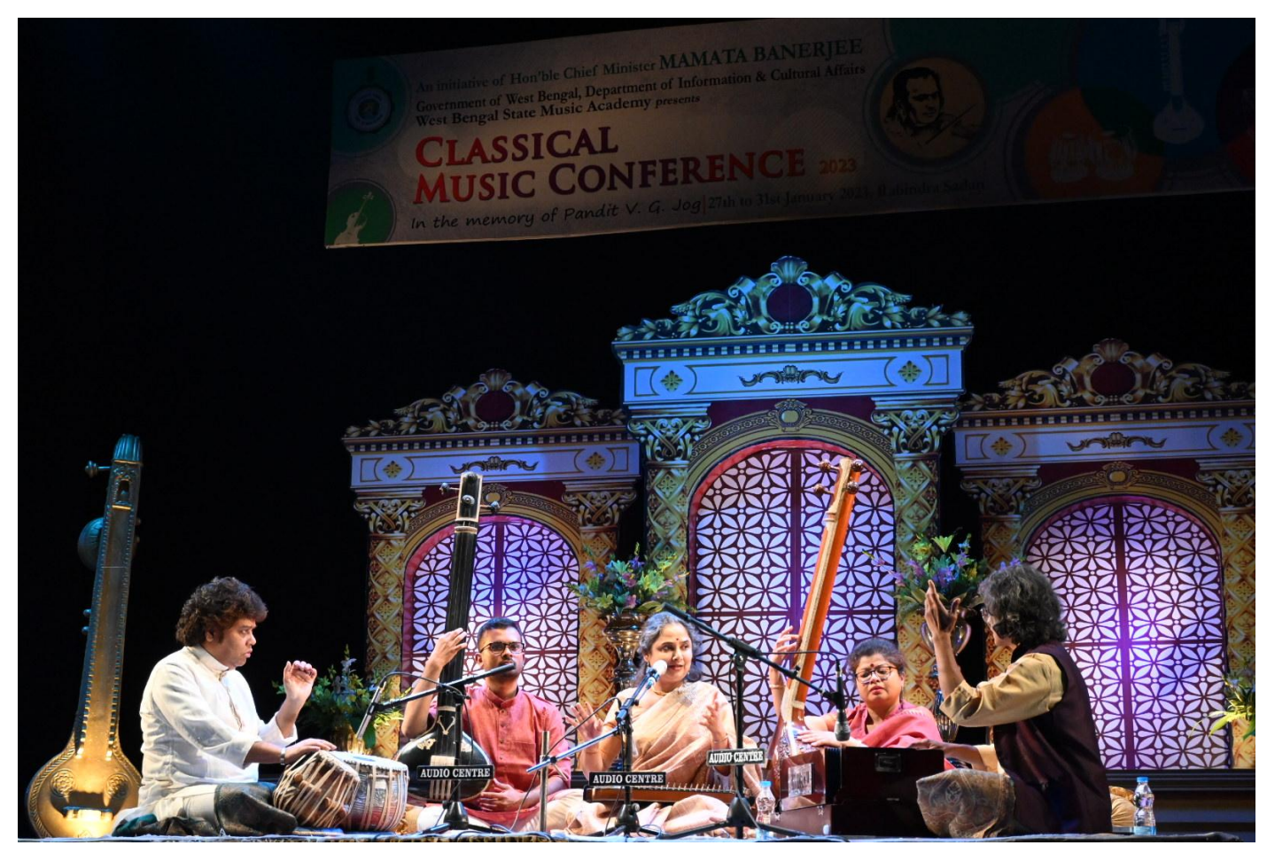
The State Academy Classical Music Conference (Kolkata, India, 2022)