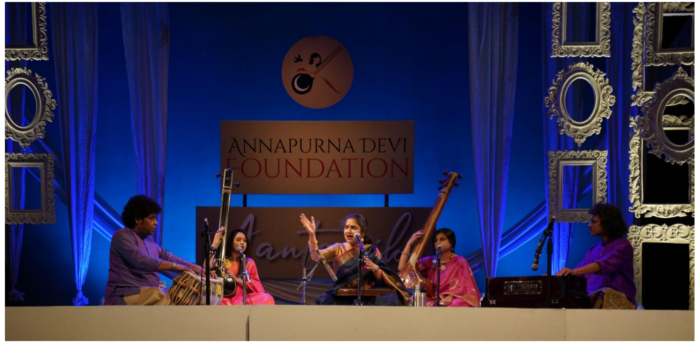
Antarik by Annapurna Devi Foundation (Kolkata, India, 2020)