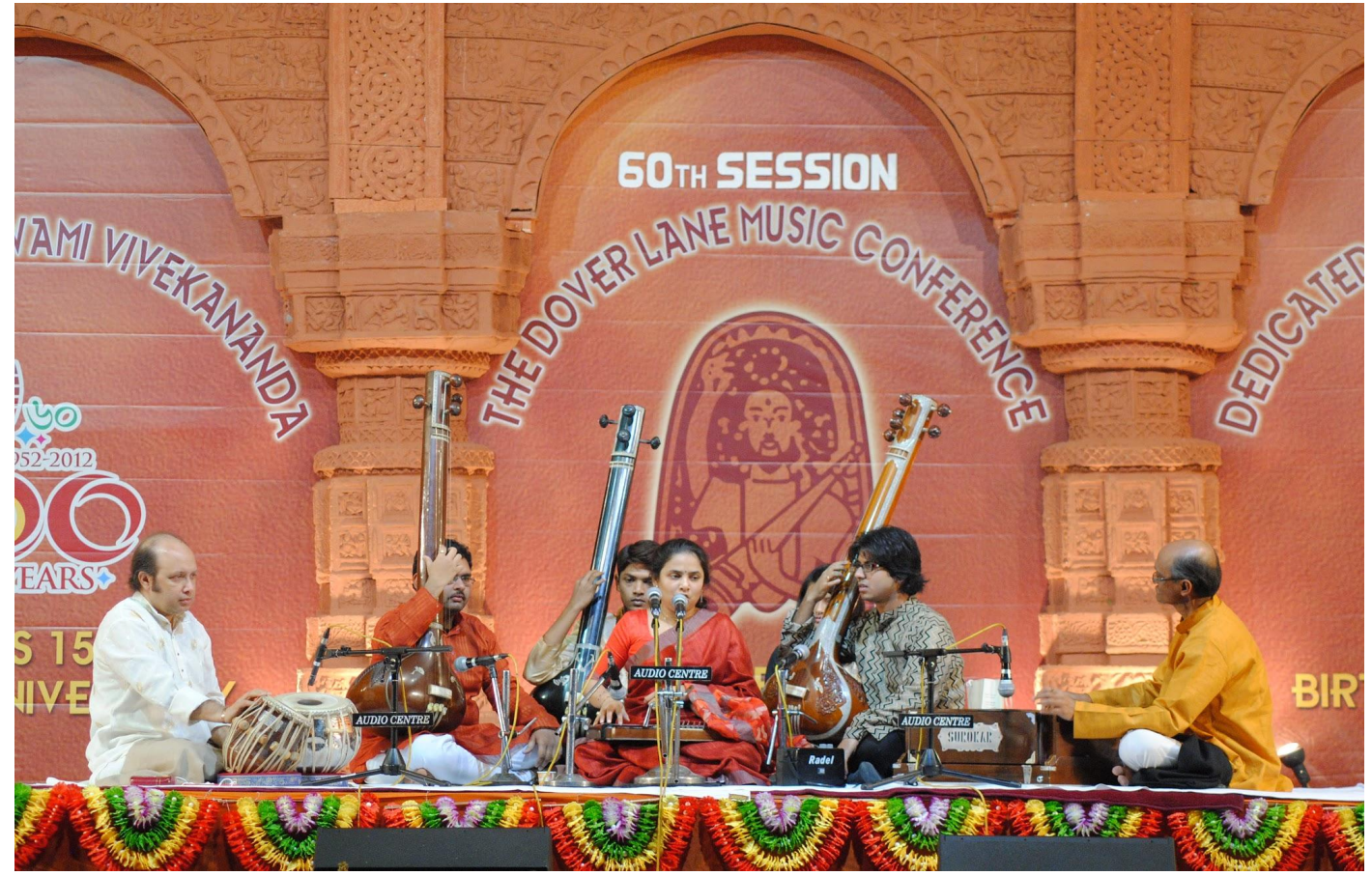
The Dover Lane Music Conference (Kolkata, India, 2012)